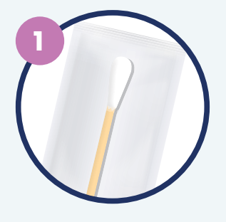
Remove a nasal swab from the pouch.