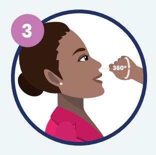
Slowly roll the swab 5 times on the inside surface of the nostril. Using the same swab, repeat in the other nostril.