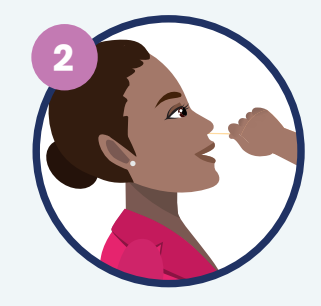
Insert the swab into one of your nostrils up to 2-3cm from the edge of the nostril.