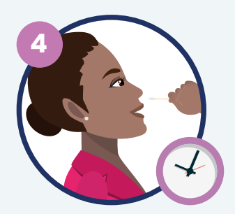
Check the kit box instructions to confirm the correct time frame to read your result. This may vary depending on the kit.