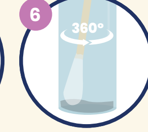
Place the swab into the solution. Rotate the swab vigorously at least 5 times. Check your instructions for how long to leave the swab in the solution.