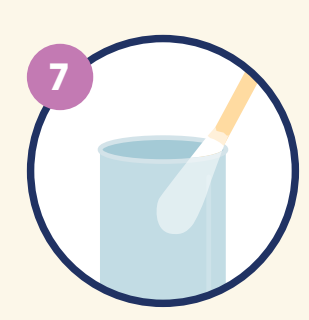
Remove the swab by rotating the swab against the vial, while squeezing the sides to release the liquid from the swab.