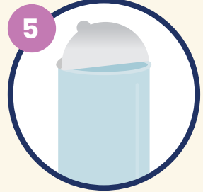
Peel off aluminium foil seal from the top of the vial, which contains the solution buffer.